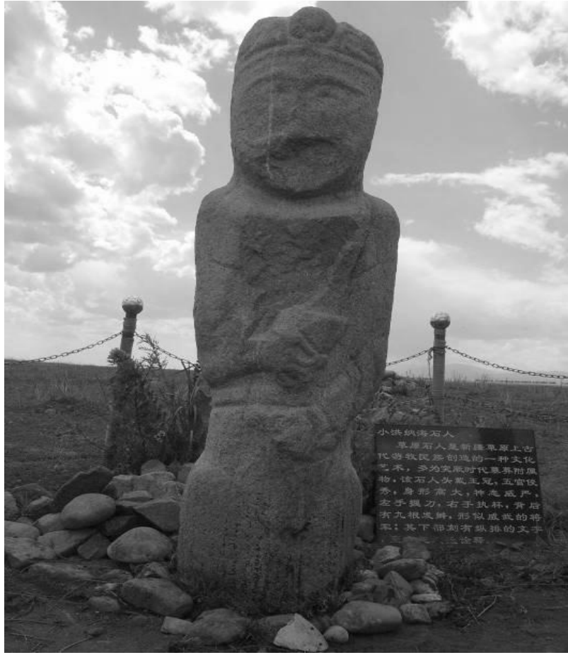
The stone statue at Little Khonakhai