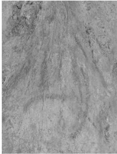
Rock painting of Dunde bulaq (detail 1)

Rock paintings are the arts of Nomads. In Altay Mt. and Tianshan Mt., ancient rockpaintings are abundant. Just in the district of Altay, more than 40 sites of rock paintings are found (Zhao 1987). We visit only a small part of them in this trip. Most of them are about livestock and wild animals, about pasturing and hunting. It is too normal to mention it. So I will just intoude two special ones here.